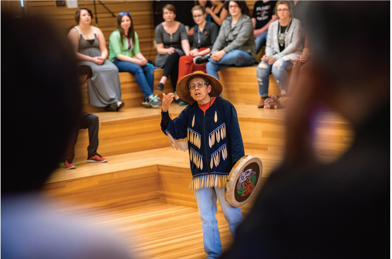
Fig 3.1: Indigenous Graduate Reception