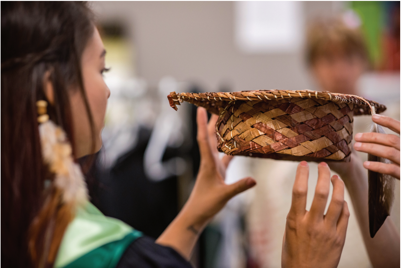
Fig 5.1: UFV Indigenous Graduate Reception 2017