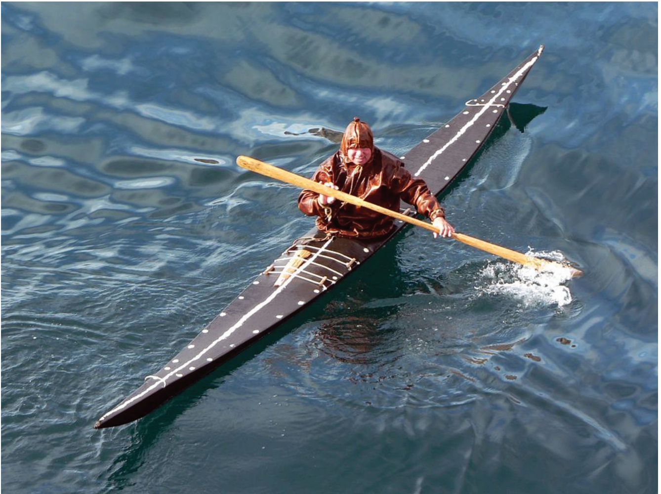
Fig 4.1: Inuit Kayaker