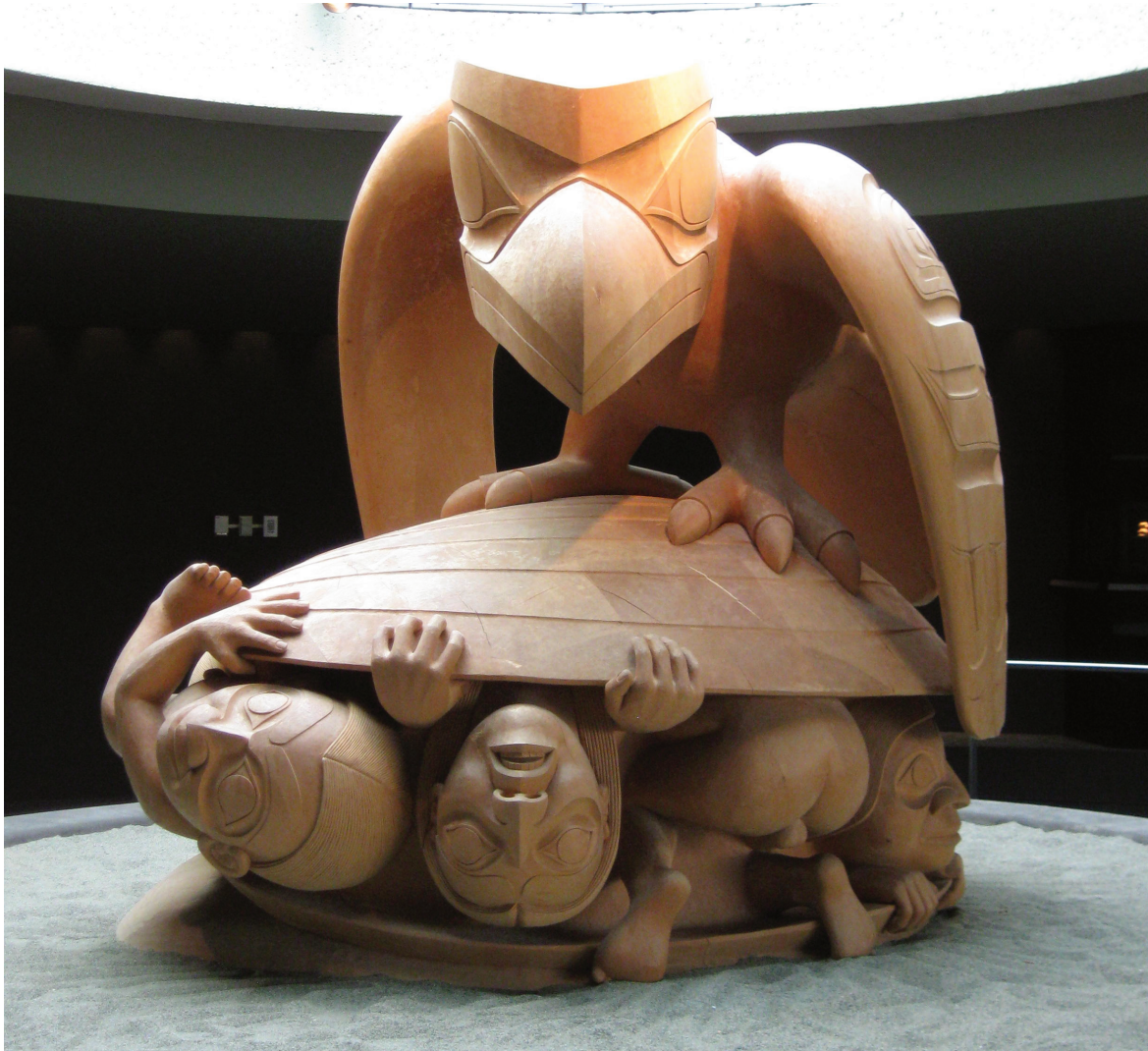
Fig 1.1 “Raven and the First Men” by Bill Reid , Museum of Anthropology, UBC, Vancouver, British Columbia